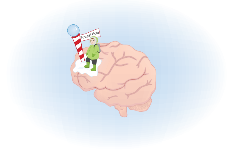
Figure 1 The frontal pole cortex (Brodmann area 10) is the most anterior region of the frontal lobe.